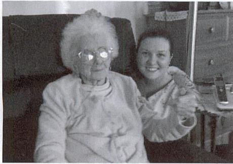
Options client at home and happy