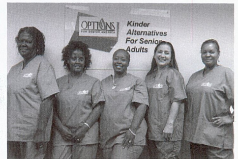
Options for Senior America caring staff